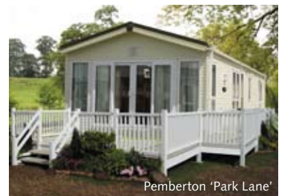
Pemberton 'Park Lane'